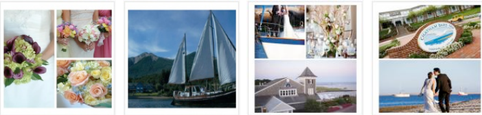
Spotlight Talent: Fancy Flowers | Destination Spotlight – Las Balsas Resort | Destination Spotlight – Wychmere Harbor Club | Destination Spotlight on Chatham Bars Inn